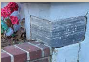
The earlier of the two cornerstones that can still be seen on the property today.