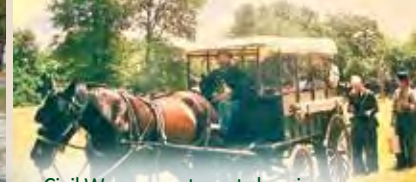
Civil War reenactment showing how wagons would have looked.